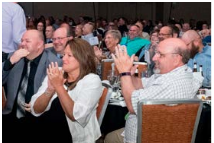
Attendees Enjoying Entertainment at APCO 2018 Connect & Celebrate Dinner