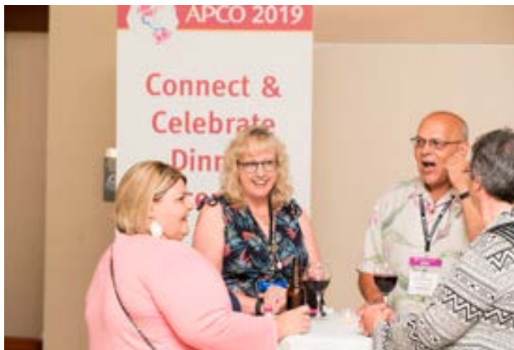
Attendees Networking at APCO 2019 Connect & Celebrate Reception